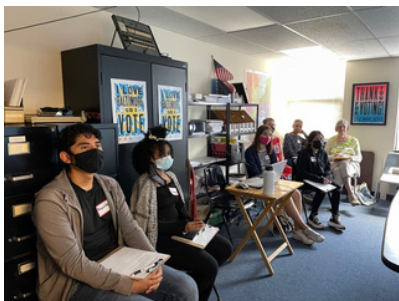
BCC students provide feedback on The Time is Now program of instruction