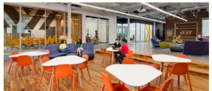
Open Works communal lounge