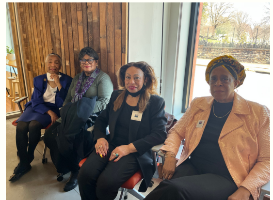
League Board Members waiting to be interviewed