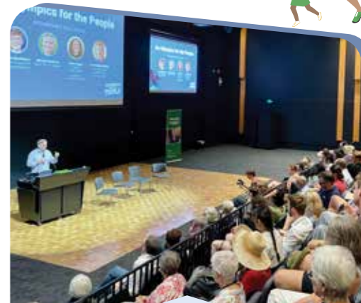
What a turnout! Thank you to the 400+ people who joined our public summit on the Olympics. Read more inside.