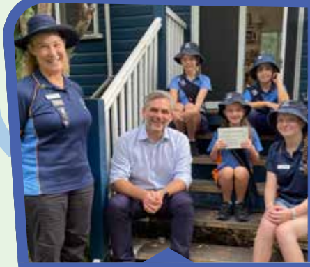
Supporting Bardon Girl Guides with funding for Auslan interpreters