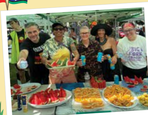
Helping locals stay cool at the Invasion Day rally