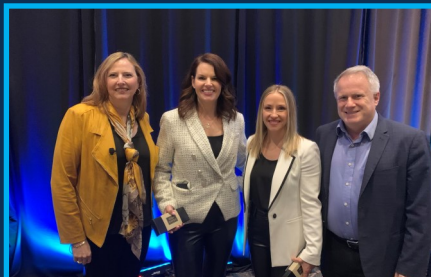
BC Tourism & Hospitality Conference