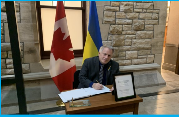
Signing the Book of Solidarity

The crisis in Ukraine is ever-growing with each passing day. Ukrainian President Volodymyr Zelinski addressed Canada's Parliament last week. His speech was deeply moving... "Imagine if it was Vancouver, Edmonton... CN Tower that was being bombed..." Such a difficult situation this nation is in.