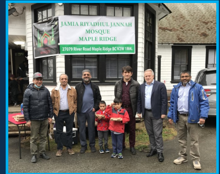
Jamia Riyadhul Jannah Mosque Visit