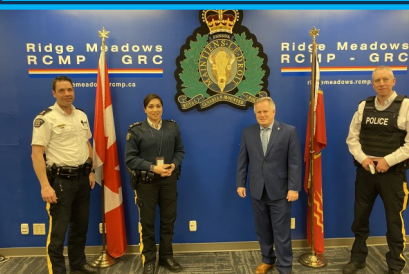
Visit to new RCMP Detachment