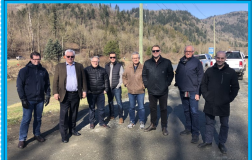
Toured flood grounds with BC MPs