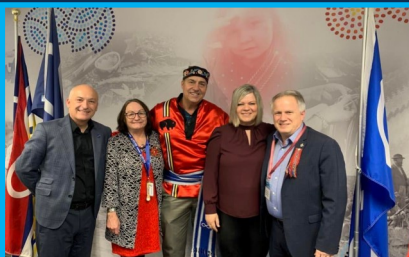
Metis Nation BC Open House