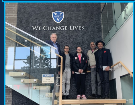
Had a tour of John Volkein Society