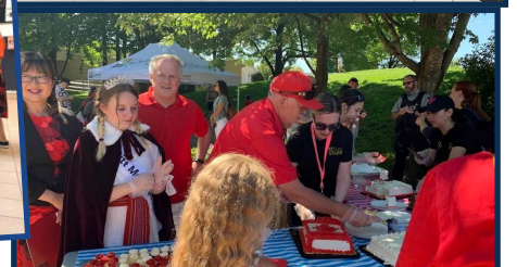
Was glad to join The Walk For Alzheimer in PMMR. 1/2 million Canadians suffer with dementia. Goal of walk is to promote awareness of dementia and raise funds for the Alzheimer's Society of B.C.