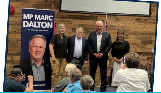
Thanks John Brassard, MP for Barrie-Innisfil for speaking at our AGM. Attendees were very concerned with the direction the current Liberal government has taken us and are eager for a change.