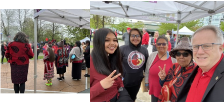
Red Dress Day for missing and murdered indigenous women and girls