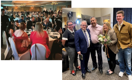
Ridge Meadows Chamber of Commerce Business Excellence Awards