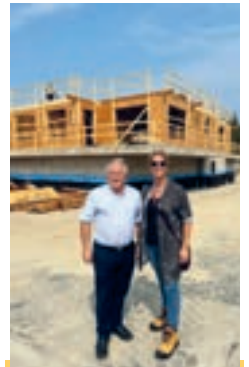
Met with developers building purpose built rental units in Powell River