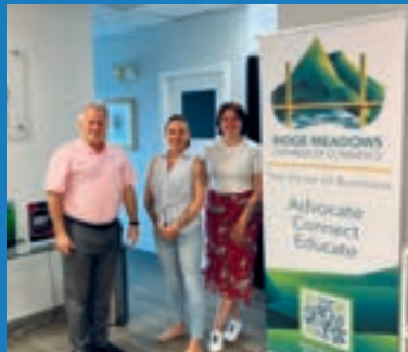
Toured the new Ridge Meadows Chamber of Commerce office