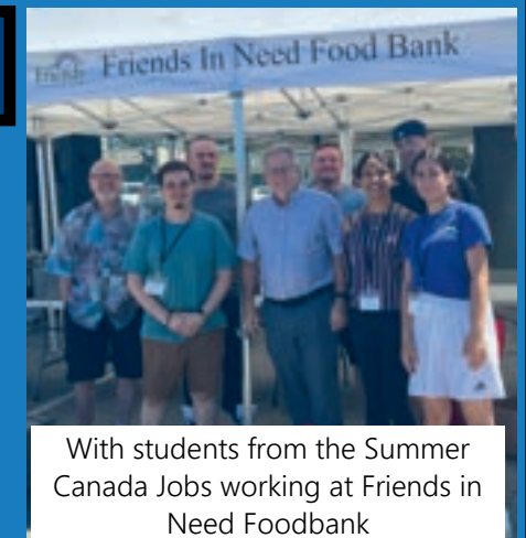
With students from the Summer Canada Jobs working at Friends in Need Foodbank