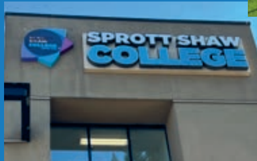
Providing Post Secondary since 1903–120th year anniversary !