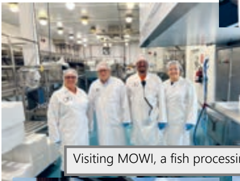
Visiting MOWI, a fish processing plant in Port Hardy