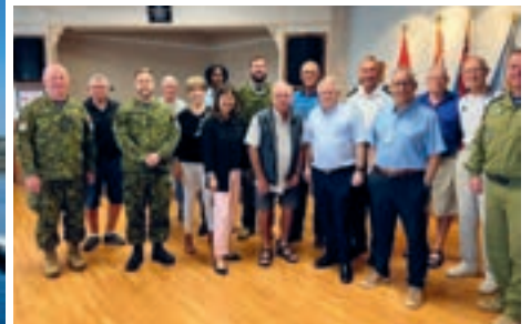
Meeting with 888 Wing of Komox Legion meeting with veterans