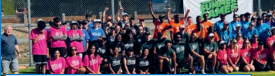
Pathfinder Youth Society held the Charity Summer Games at Telosky Stadium