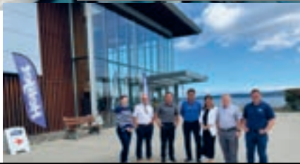
At Nanaimo's Helijet terminal meeting with the CEO