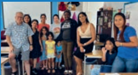
With Sprott Shaw students enrolled in the ECE Program