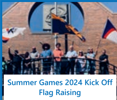
Summer Games 2024 Kick Off Flag Raising