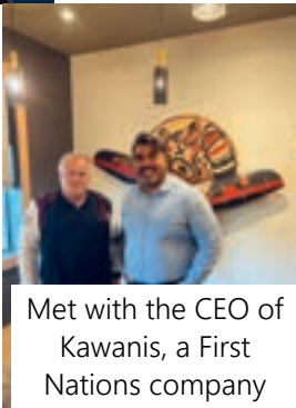
Met with the CEO of Kawanis, a First Nations company