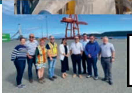
In Nanaimo learning about the Port expansion vision