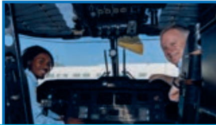
19 Wing Comox visit with the Men and Women who serve Canada