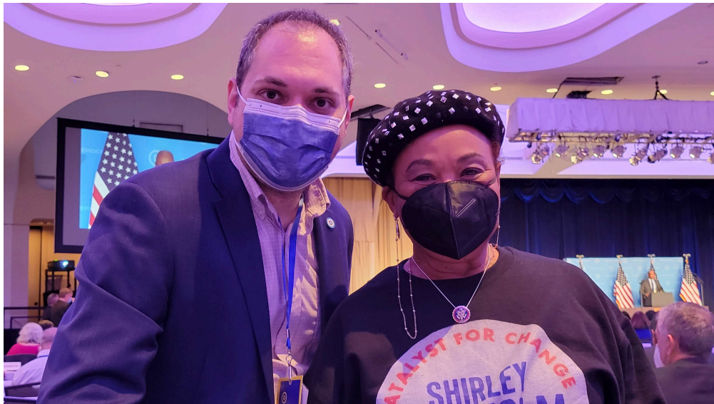
With Congresswoman and DNC Member Barbara Lee (CA) at General Session

Also at General Session, the DNC considered and approved two amendments to the Charter and Bylaws. Those amendments can be found here. While I had initial concerns, I thank DNC staff for providing additional clarity.