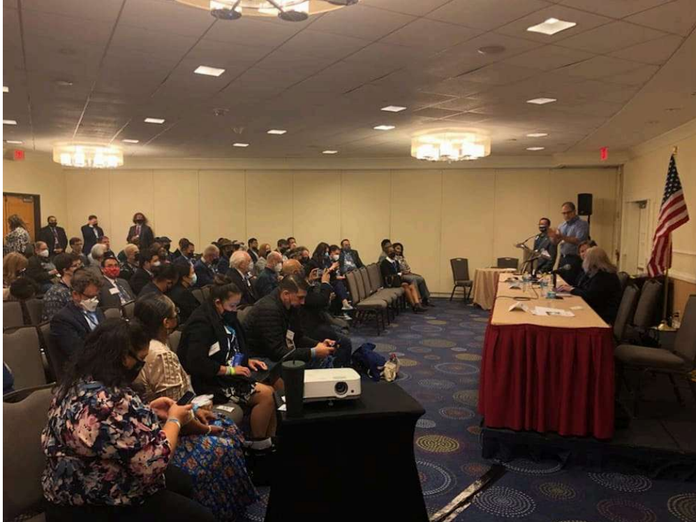
Speaking at the Western Caucus after my election

Here was the agenda for the Executive Committee. Aside from a report on redistricting and speeches, no significant business was conducted.