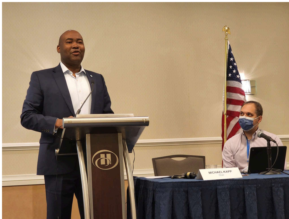
DNC Chair Jaime Harrison speaks at the DNC Youth Council