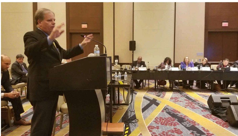
Senator Doug Jones speaks before the DNC Credentials Committee

We heard two combined challenges against the DNC credentials of the Chair and Vice Chair of the Alabama Democratic Party, alleging that the meeting that resulted in their election was improper. After discussion, I believed that (1) the Alabama Democratic Party structure essentially barred any minority groups (other than African-Americans) from participating; (2) there was no effective notice; and (3) that proper election procedures were not followed. Therefore, I argued that the election results should be thrown out and the credentials for the Alabama Chair and Vice Chair should be revoked, and a new election called.