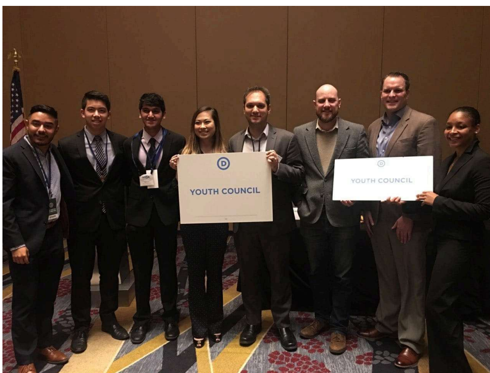
DNC Youth Council with the Chair and Co-Chair of the High School Democrats of America and the leadership of the Young Democrats of America

Thursday, August 23: DNC Youth Council, DNC Credentials Committee