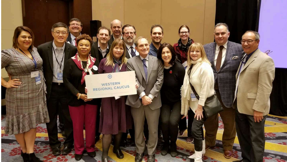
the California delegation to the DNC (photo taken after the Western Regional Caucus meeting)

As always, if you have any questions about this meeting or anything else related to the DNC, please feel free to reach out to me by email , Facebook , Twitter , or text/call me at (510) 717-8260.