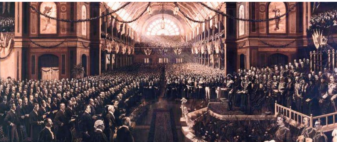
The Opening of the First Federal Parliament of Australia by HRH The Duke of Cornwall and York, later King George V. Original painting by Charles Nuttall. (This electrograph hangs in the Library of the Australian Monarchist League.)

The Australian Monarchist League (AML) is a nationally recognised organisation committed to defending the Australian Constitution and promoting democratic freedoms under the Crown. Reformed in 1993 as a totally Australian entity, AML has grown into a powerful voice for constitutional monarchy, advocating for the enduring value of Australia's system of governance.