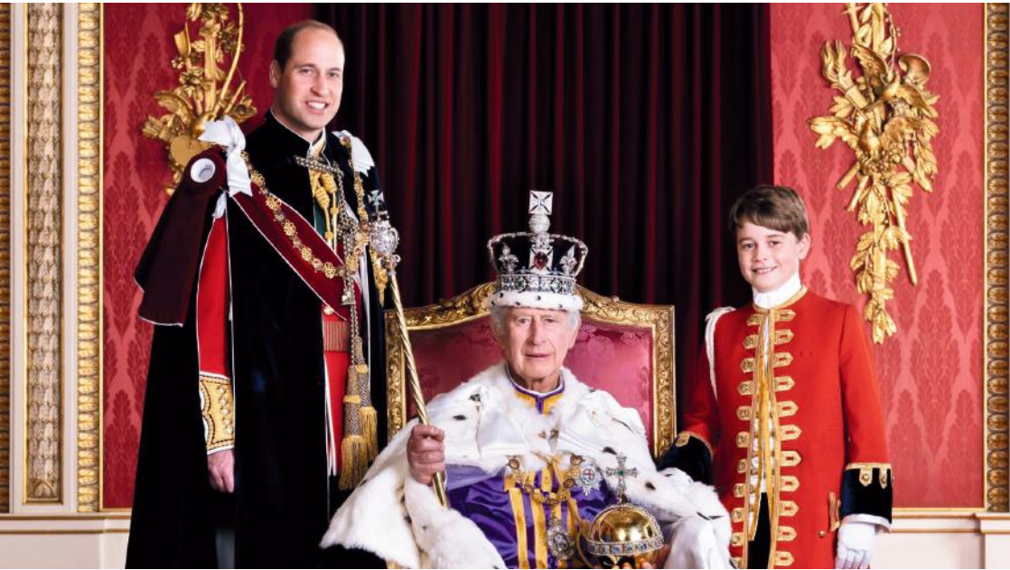
The Royal Succession and the future.