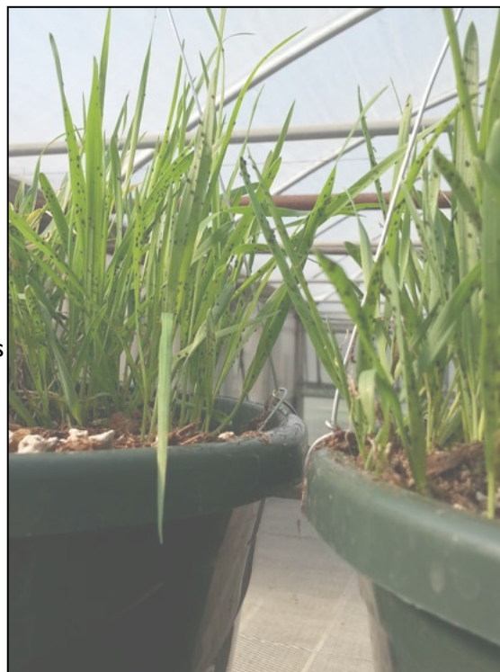
Banker Plants