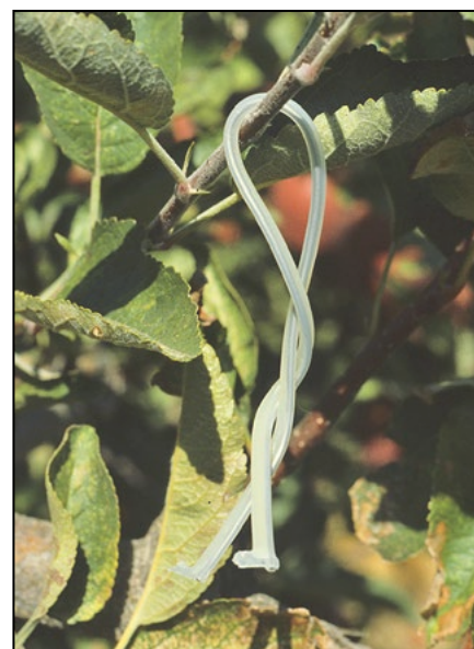
Pheromone dispenser for mating disruption.