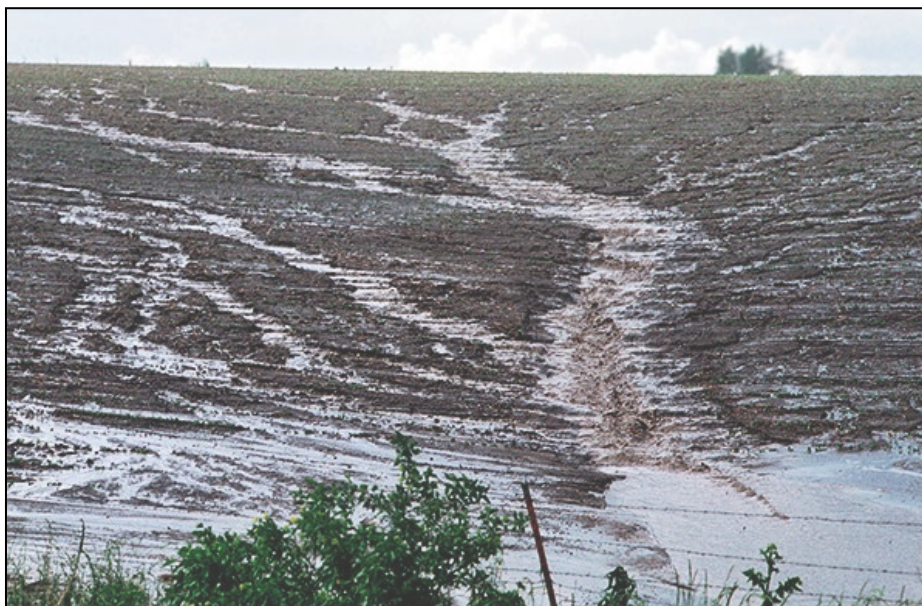
Soil Erosion | Photo: East Multnomah Soil and Water Conservation District