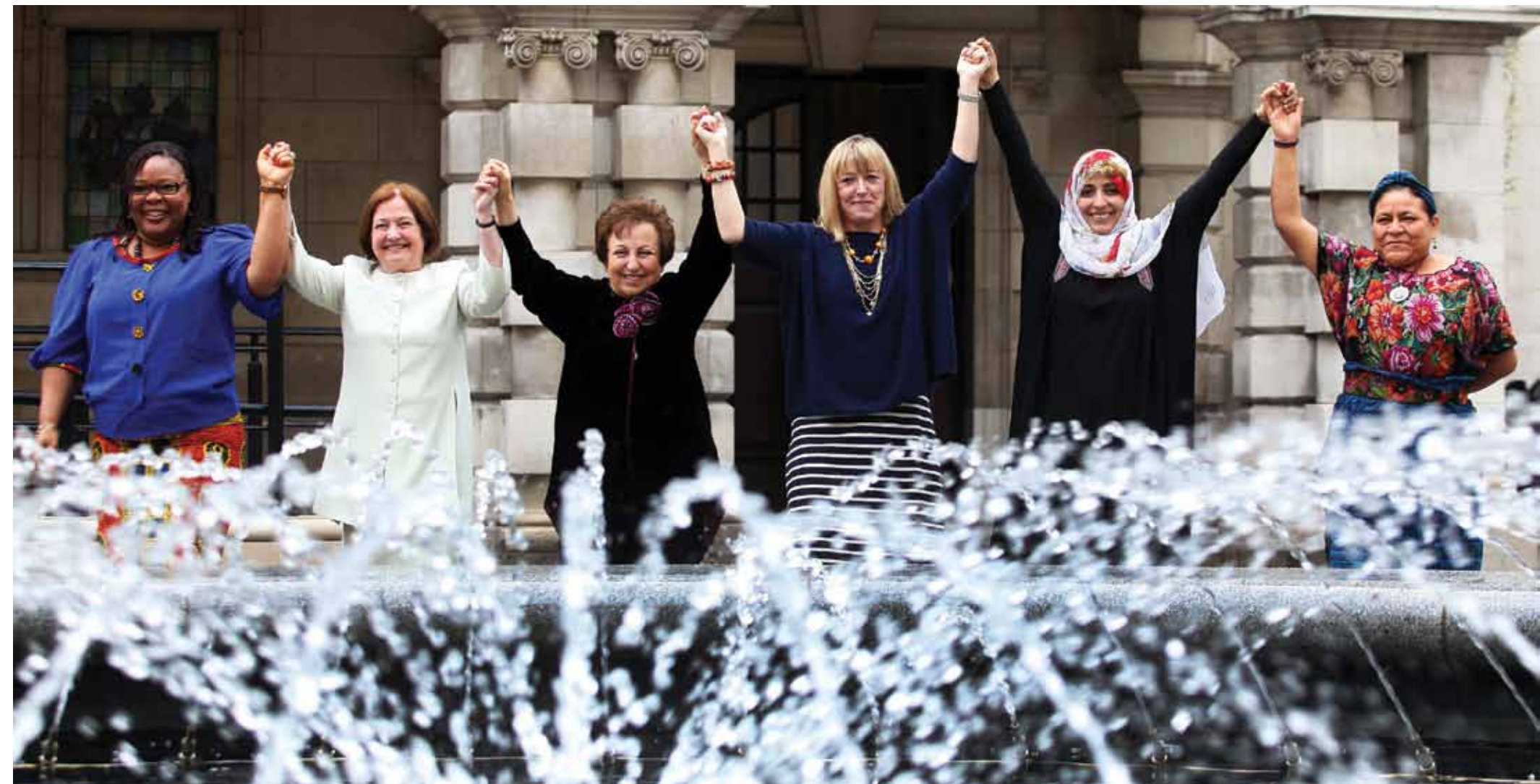
Nobel laureates from L to R: Leymah Gbowee, Mairead Maguire, Shirin Ebadi, Jody Williams, Tawakkol Karman, and Rigoberta Menchú Tum