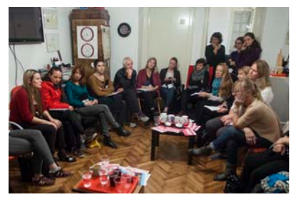
Delegates meet with ATINA