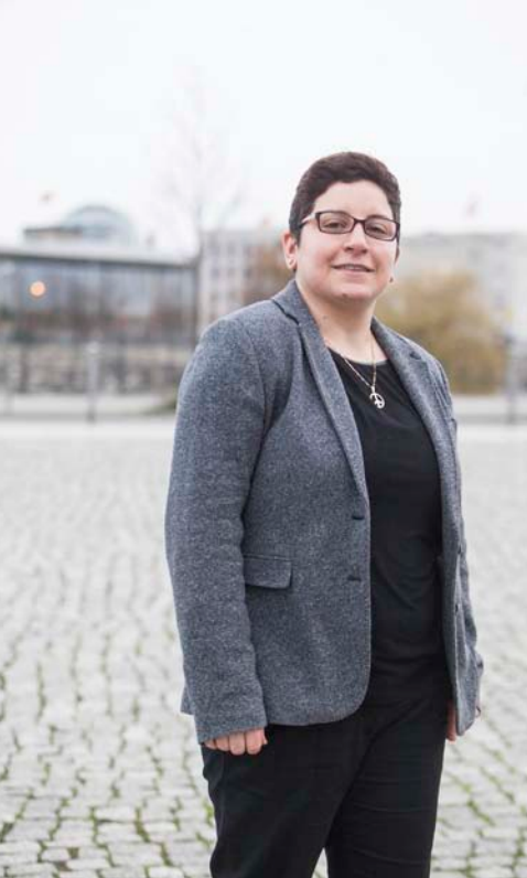
Members of the Syrian Women's Network and Syrian Women's Initiative for Peace and Democracy

plan during the peace negotiations in Geneva in January 2014. Since then, they have been in constant dialogue with key policy-makers, including UN Special Envoy to Syria Staffan de Mistura, to ensure women are heard and included in political processes.