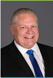
DOUG FORD Progressive Conservative