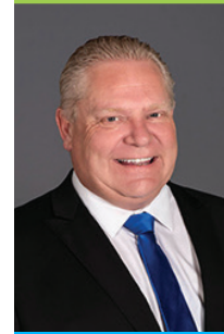
DOUG FORD Progressive Conservative