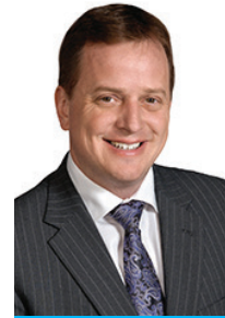
JEFF YUREK Progressive Conservative