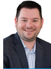
MIKE HARRIS Progressive Conservative