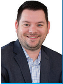
MIKE HARRIS Progressive Conservative