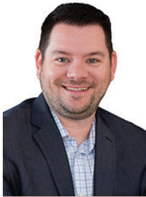
MIKE HARRIS Progressive Conservative