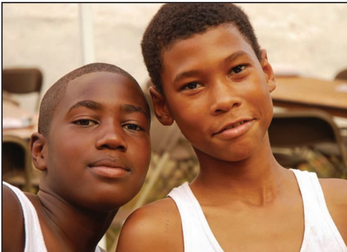
ABOVE: Chillin’ at the ONE DC cookout at Poplar Point – the people’s park!