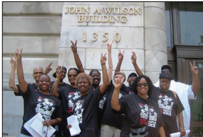
ABOVE: ONE DC members and local residents celebrate outside the Wilson Building after winning DC Government's pledge to build affordable housing at Parcel 42.

Oct 2 - "The wrangling over Poplar Point..is turning into a grand story of brute political power, feisty environmentalists, and crafty community activists."