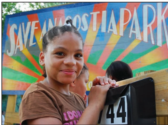
ABOVE: A rally and cookout helped focus public attention on issues facing residents near the proposed new soccer stadium in Anacostia.

ONE DC plans to strengthen the Barry Farm Coalition , a group of public housing residents, Anacostia residents, non-profit allies, and Facilitating Leadership in Youth (FLY) members organizing for a resident-led redevelopment process for Barry Farm, Parkchester, and Wade Road. ONE DC will focus on boosting adult participation in the coalition, and FLY will focus on increasing youth involvement.