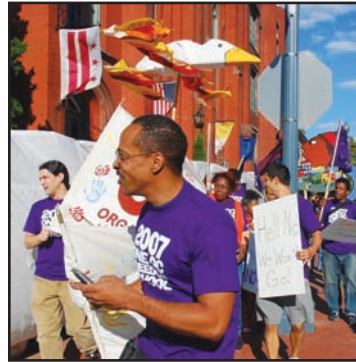
ABOVE: ONE DC Freedom School takes it to the streets.