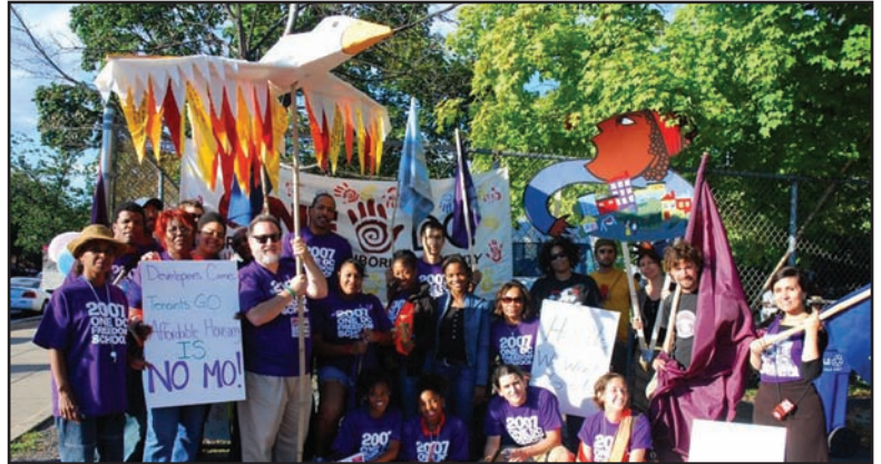
ABOVE: Freedom School parade – hooray!

We want to take this opportunity to fête all of the institutions and individuals that make ONE DC's work possible. We celebrate each and every one of you because without you, ONE DC would just be a dream. And please charge it to our heads and not our hearts if we have made any omissions or errors!