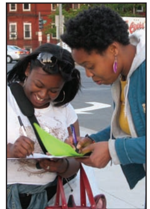
ABOVE: ONE DC in action!

ONE DC's progressive organizing values are heavily influenced by the principles and achievements of the Student Nonviolent Coordinating Committee (SNCC), as well as other groups and people-led movements for justice and human rights that have occurred throughout the world.