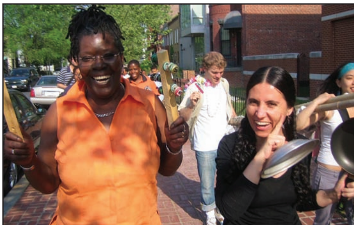
AT LEFT: Cantastoria Street Performance and revelry in Shaw.