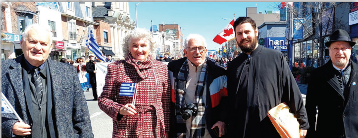
The 2023 Greek Independence Day Parade on the Danforth.

In February I moved a successful motion to improve pedestrian safety in the RH McGregor Public School area. My motion called for a second crossing guard at Coxwell and Mortimer and the relocation of a bus shelter to provide more space for pedestrians.