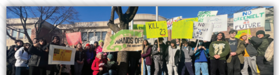
Paula with Riverdale C.I. students during their protest of Bill 23.

The province's Bill 23 allows for development on the Greenbelt, two million acres of protected land that's critical to our environment. It could also prevent the city from requiring developers to replace affordable housing units in new developments. This will accelerate the loss of affordable housing, drive up rents and force people out of Toronto or into our overloaded shelter system.