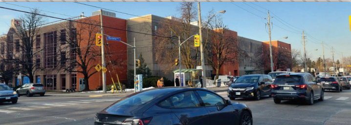
RH McGregor Public School at Coxwell and Mortimer.

Work is scheduled to begin this year. More information is available at toronto.ca/millwood-road-safety-improvements .