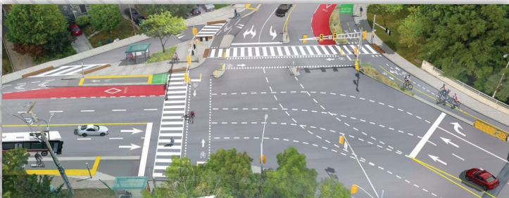
City of Toronto rendering of proposed intersection redesign.

Visit their website deeplyrootedmarket.ca for more.