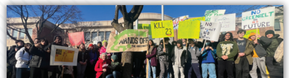
Paula with Riverdale C.I. students during their protest of Bill 23.

The province's Bill 23 allows for development on the Greenbelt, two million acres of protected land that's critical to our environment. It could also prevent the city from requiring developers to replace affordable housing units in new developments. This will accelerate the loss of affordable housing, drive up rents and force people out of Toronto or into our overloaded shelter system.