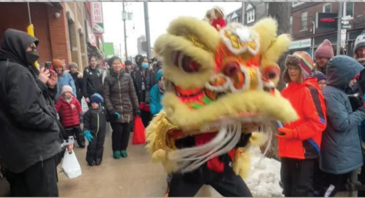
Celebrating the Year of the Rabbit on Gerrard.

Thanks to the advocacy of dedicated community members, Metrolinx announced that the GO Train Layover facility initially planned for the Don Valley would be relocated. The city will now begin work on the long awaited Wonscotanach Park. This new park will be a companion piece to the many great parks along the Don River, including the soon to be completed parks in the Port Lands, Corktown Common and Riverdale Park East and West.