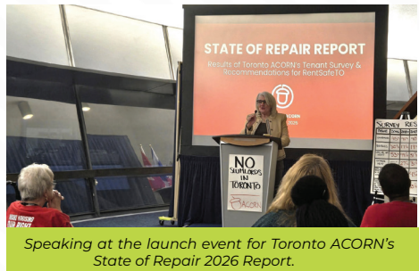
Speaking at the launch event for Toronto ACORN's State of Repair 2026 Report.

A truly mixed community with TCHC units, rentals and condos, one of my first acts when ward boundaries changed in 2018 was to fight for new affordable units at this site.