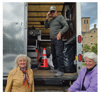
Don't miss out on the free paper shredding at my Dieppe Park Environment Day!

At my 2025 Environment Days, residents dropped off more than 38 tonnes of electronics and household waste and 6,000 pounds of documents for shredding.