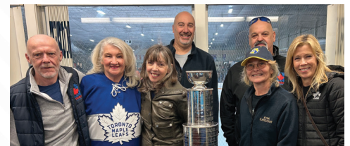
At the 81st Little Stanley Cup Day. Thank you to all the EYHA volunteers for all you do!