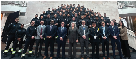
At a graduation ceremony for 58 new city Traffic Agents, who will help ease congestion and keep Toronto moving safely.

So far, eight drivers have been removed from the Pape and Danforth site for disobeying the safety plan.