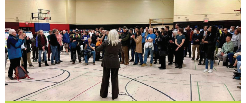
Speaking to residents at the Port Lands Open House in March. It was heartening to see over 600 people attend.