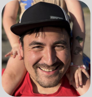
Beyoung Yu Zone 1