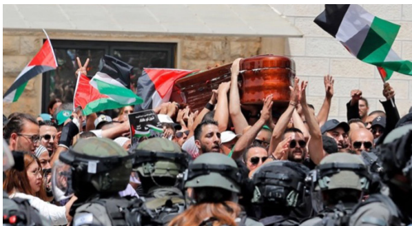
The assault on the mourners of Shireen Abu Akleh, who were beaten with clubs in East Jerusalem by Israeli police.

Being a reporter is a very dangerous occupation throughout most of the world. Fifty-five journalists and media professionals were killed worldwide in 2021 and 488 imprisoned. In 2022 at least 11 journalists have been murdered in Mexico alone, and at least 20 international journalists have been killed in the war in Ukraine.