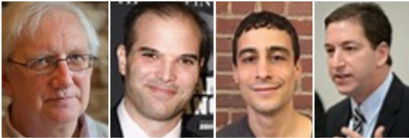
(L-R) Craig Murray, Matt Taibbi, Aaron Maté, Glen Greenwald

Matt Taibbi is an old-school journalist (formerly with Rolling Stone) who works very hard to make sure he does not print something he will have to retract (with the exception of his prediction that Russia would NOT invade Ukraine!) I love this guy. You can find him on Substack at taibbi.substack.com . He is kind in making many of his offerings public, but if you want access to everything, I recommend that you pay the modest yearly fee.