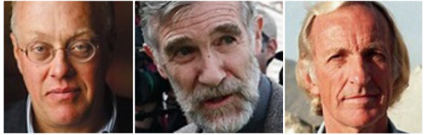
(L-R) Chris Hedges, Ray McGovern, John Pilger