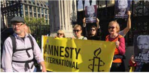
Amnesty International forms part of the human chain around Parliament for Assange.