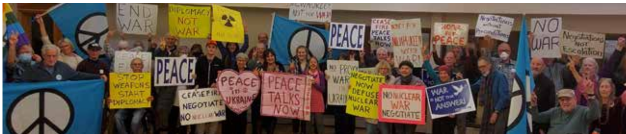
October 20, 2022: Peace Action of WI hosts Medea Benjamin (center) at the Milwaukee Friends Meeting House.