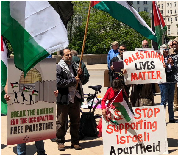
Local peace activists rally for Palestine.

As the newly elected, far-right government of Israel settles into power, the news is already filling with even more stories of violence by the Israeli army against the Palestinian people. Homes and refugee camps are being raided and destroyed, and families attempting to defend their homes are being slaughtered.