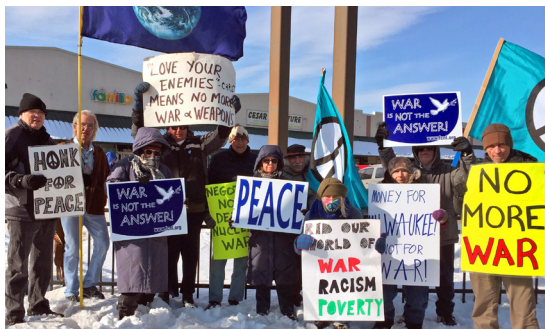
The "regulars" brave the snow at Stand for Peace on February 4, 2023.

If you are not receiving our Peace Action Email Alerts please email us your email address so you can keep in touch with current activities.