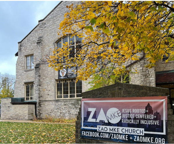
Our new home at ZAO MKE Community Church across from the UWM Union