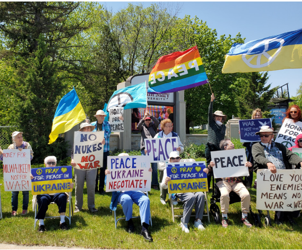
The School Sisters of Notre Dame joined the Peace Action regulars in a stand for Peace near their home.