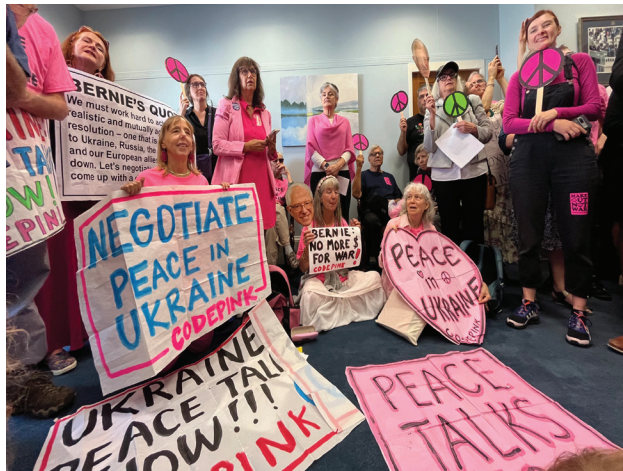
A sit-in at Senator Sander’s office led to 11 arrests

We, the undersigned, call on every member of the United States Congress to vote NO on new weapons for the Russia-Ukraine-NATO war. President Biden’s latest request for another $24 billion –most of that for weapons and military training – will put the cost of this war at nearly $140 billion for US taxpayers, most of whom live paycheck to paycheck, struggling to make ends meet. There is no military solution to this war; only heartache as the US escalates a proxy war between Russia and the United States, the two most nuclear-armed nations.