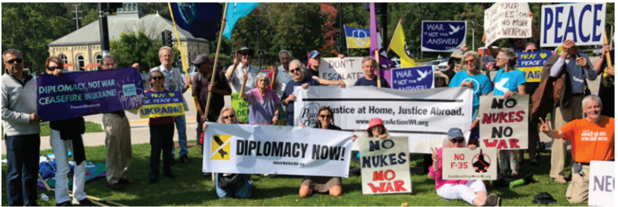
On September 30, Milwaukee activists call for diplomacy now in Ukraine