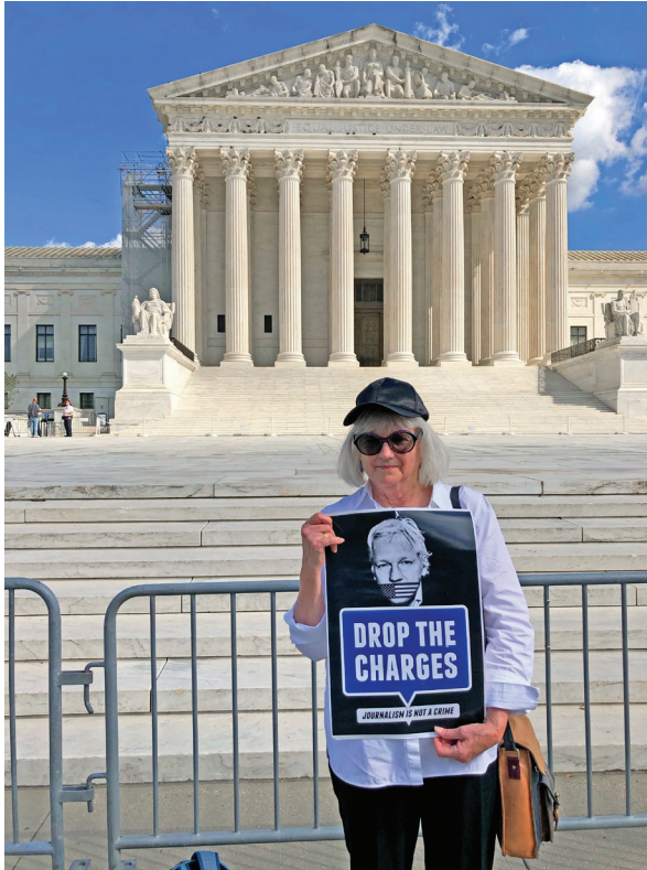
Standing with Assange at the U.S. Supreme Court

The Australian Prime Minister Albanese will visit President Biden October 23-25. While his efforts to free Julian Assange have been rebuffed in the past, it