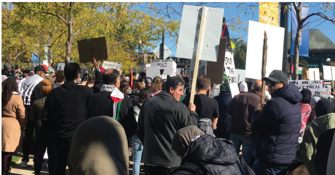
Members of Peace Action of Wisconsin took part in a march with thousands of protesters for Palestine in Milwaukee on Sunday, October 22.

As a coalition of Wisconsin based organizations working for peace and justice in our state and our world, we commit to ensuring an honest narrative of the Palestinian plight and an end to our government's support of Israel's brutal apartheid system in Palestine.