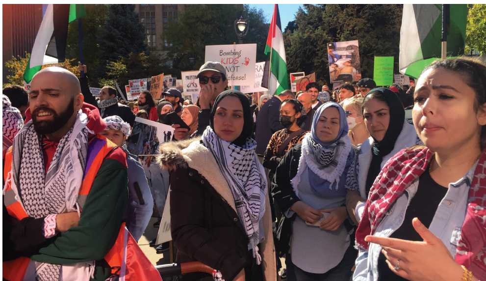
Thousands of marchers protesting for Palestine marched from Dontre Hamilton Park to the Sunburst statue on Sunday, October 22.

"We are deeply saddened by the loss of Israeli and Palestinian lives, and condemn unequivocally the years of provocation by one of the most extreme supremacist Israeli governments in history.