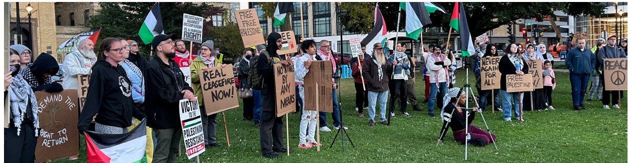
On October 20, Peace Action of WI joined other groups at Cathedral Square in Milwaukee to protest violation of the ceasefire in Gaza.