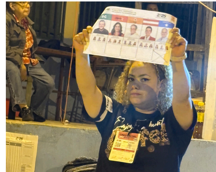
On November 30, a woman displays a ballot marked for Nasry Asfura in the Honduran election.

One thing that seems obvious was the effectiveness of the US campaign to influence the election. Trump went all-in for Papi and the National Party, threatening to withhold all support and make Honduras his personal enemy if his choice lost. When told the last leader from that party was a narco-dictator who was extradited and