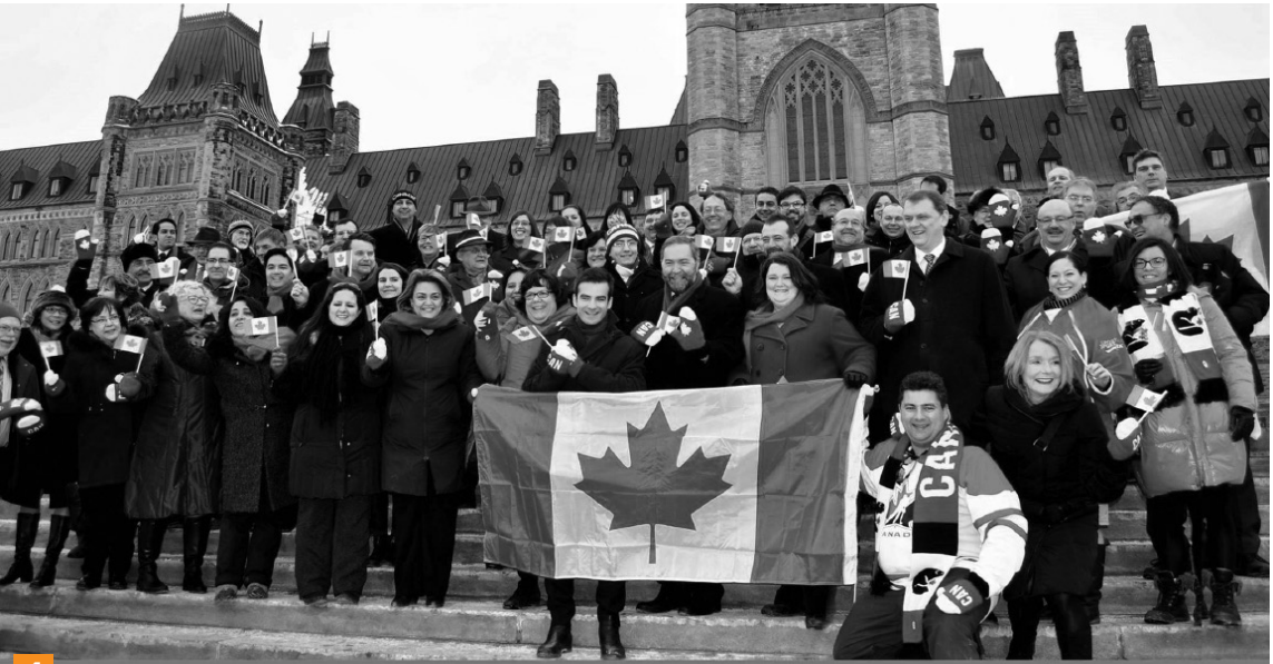
4 Fiers de soutenir les athlètes olympiques canadiens. Proud to support Canada's Olympic athletes.