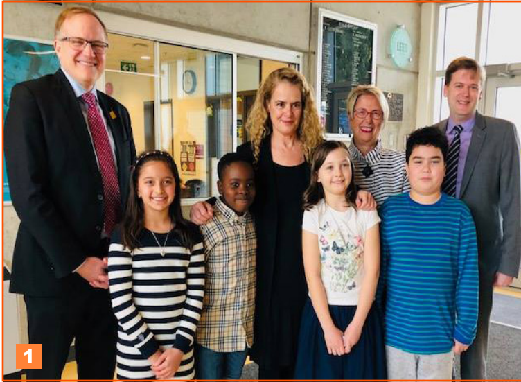
1 The “Royal City” New Westminster welcomed Her Excellency the Right Honourable Julie Payette, Governor General of Canada in March at Qayqayt Elementary School. Glad to know that Her Excellency took such an interest in the New Westminster Schools Lunch Program - “Fuel Up!”