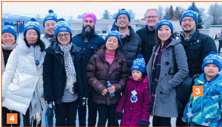
4 Burnaby 2019 Coldest Night of the Year was a great success with 285 walkers and 40 teams! A big thank you to the 93 volunteers and the Burnaby firefighters for coming out to help in so many ways!