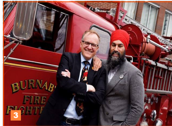
5 Great conversations about the social, economic & environmental costs of the Trans Mountain Expansion pipeline Project (TMX) with the New West Climate Action Collective. We are working hard to help save our environment.