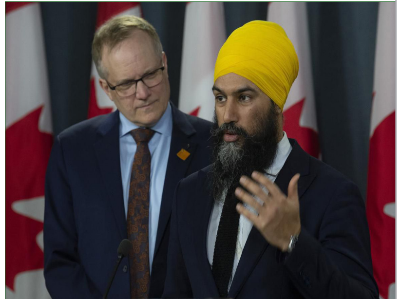
NDP Finance Critic Peter Julian, left, looks on as NDP Leader Jagmeet Singh, MP (Burnaby South) speaks to reporters at a press conference held in Ottawa on March 13 where he unveiled the NDP's top priorities ahead of the federal budget 2019 tabled in the House of Commons on March 18, 2019 ■

Money laundering not a victimless crime. The federal government needs to follow the lead of the NDP government in BC against money laundering. Why does the Trudeau government refuse to put into place a publicly accessible beneficial ownership registry? And why does the federal government refuse to require reporting of huge cash transactions to buy luxury goods?