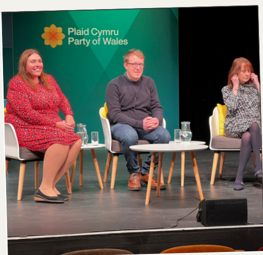
Plaid Cymru Conference Llanelli 2023