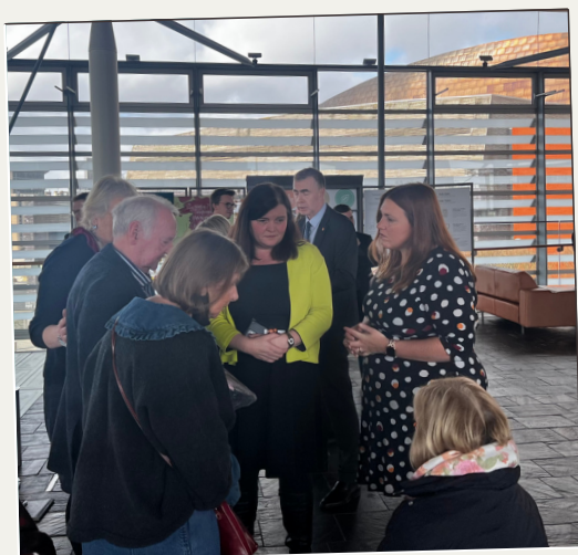
Covid-19 bereaved families for Justice Cymru