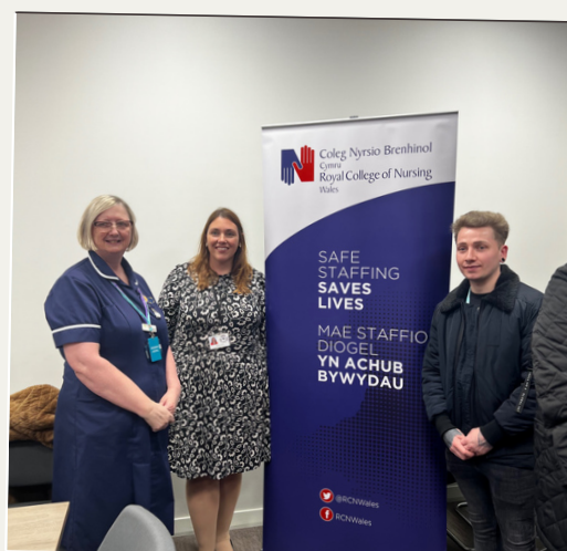
Meeting with Student Nurses