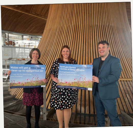
Healthy Air Cymru