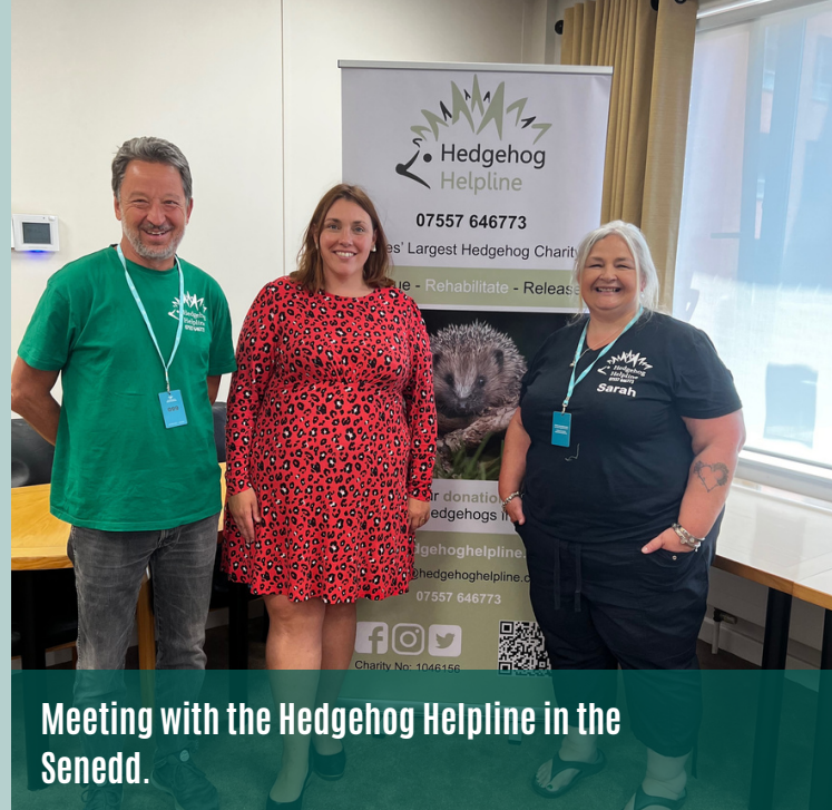
Meeting with the Hedgehog Helpline in the Senedd.

Around 150 letters were received this month about all kinds of issues discussed in parliament. Several individuals wrote to me about the additional living costs that affect disabled people - as much as £975 more than the costs of a person without a disability in some cases. Several people have also been in touch about the Welsh Government's cuts to the funding for Free Meals in the holidays and I have challenged this in the Senedd.