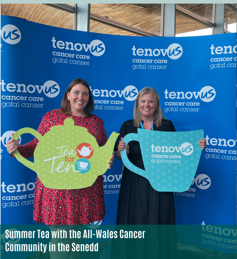
Summer Tea with the All-Wales Cancer Community in the Senedd