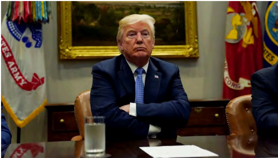
Photo from Trump will overplay his hand. Be ready for when he does.