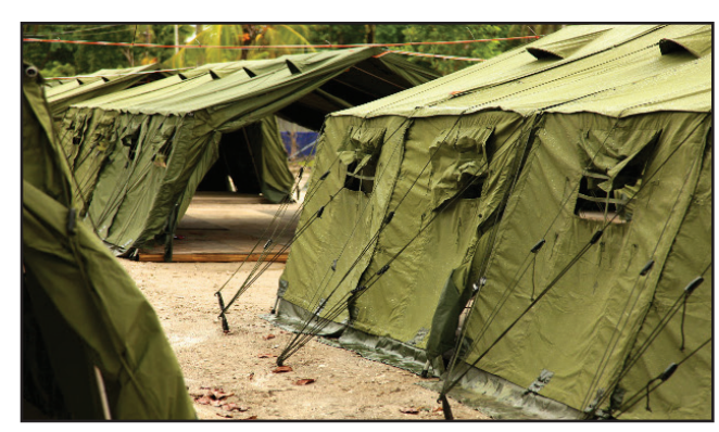
Costly, damaging and illegal

The damage and human cost of this regime has been documented in a variety of reports and assessments by international and Australian organisations. Recently, those held on Manus Island sued the Australian Government for the harm that their ongoing detention has caused. The Australian Government settled for over A$70 million, the largest ever pay-out in a human rights class action.<sup>2</sup>