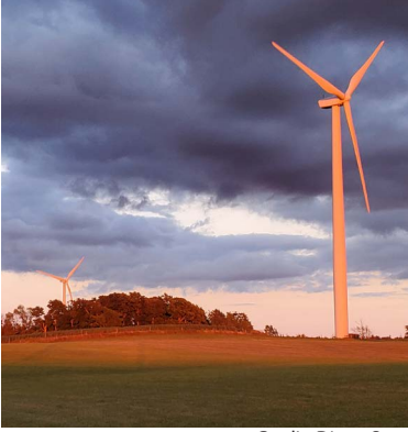
Gargantuan wind turbines like these are being forced on the residents of Collins, N.Y.

A public meeting was held on Aug. 9 for all interested citizens to hear directly from the EDF representatives. The meeting had more than 300 people in attendance, filling every seat, and leaving 100 people standing. Out of this crowd,