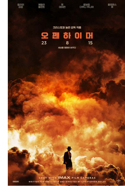
A Korean poster for the movie Oppenheimer.

Reflecting on this during a visit to Moscow in 1945, Gen. Eisenhower said: “Before the atom bomb was used, I would have said yes, I was sure we could keep the peace with Russia. Now I don’t know. I had hoped the bomb wouldn’t figure in this war. Until now I would have said that we three [Britain,