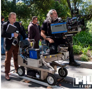
Director Christopher Nolan (l) said he wanted to make people realize that nuclear war is a real thing.

is far worse than even that. Today, NATO has put Russia into what is essentially a reverse Cuban Missile Crisis on steroids and is showing no rational understanding of where this situation is likely to end up. Russia has responded by threatening to change their nuclear doctrine to one of potential first-strike—mirroring the policy employed by the United States. A nuclear power can never be defeat-