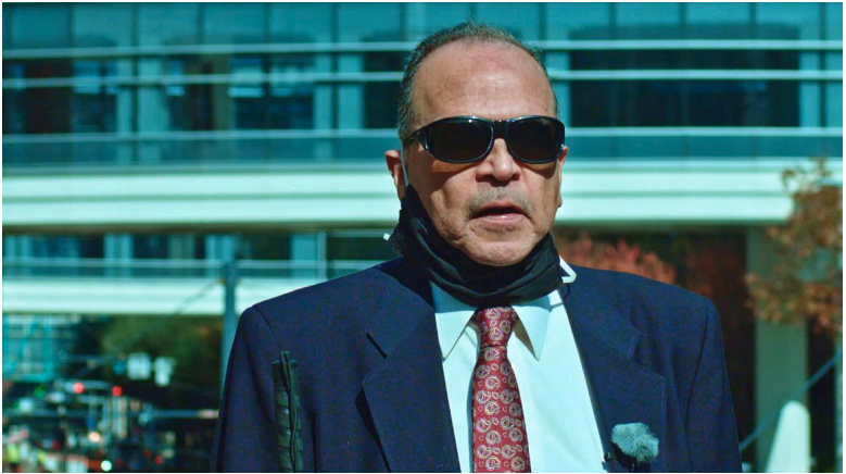
Independent candidate for Congress in Texas 38th CD is shown here speaking in front of the world-class Houston Medical Center.