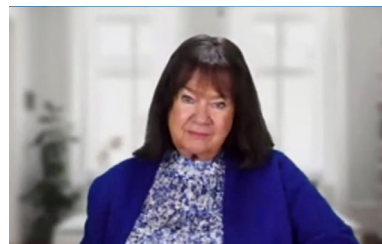
Helga Zepp-LaRouche, chairwoman and founder of the Schiller Institute.

There is no place on this Earth—and that includes the strategically explosive potential of destabilization operations around