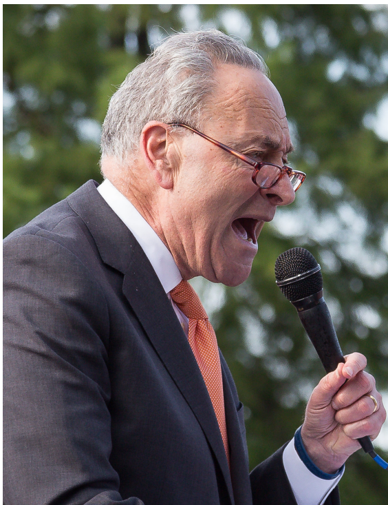
Wall Street chief Congressional dope pusher Sen. Chuck Schumer (D-NY)’s pot legalization legislation looks like its in trouble.

Free Crack Pipes? But before you think that this means that reality is somehow seeping into the Executive Branch, the Department of Health and Human Services revealed last week that they have issued a $30 million grant to purchase and distribute crack pipes as means of stopping the spread of the Covid-19 virus. This was too much for Senators Joe Manchin (D-WV) and Marco Rubio (R-Fla), who have submitted a bill to prevent this lunacy. Schumer and his co-sponsor Sen. Corey Booker (D-NJ) have claimed that their pot legislation would create enormous opportunities for minority-owned businesses