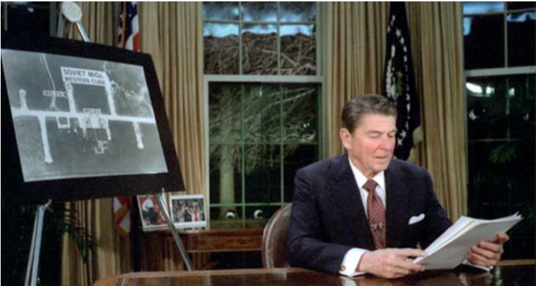
President Ronald Reagan announcing the Strategic Defense Initiative in a speech in the Oval Office on March 23, 1983.

On March 23, 1983, in an address to the nation, President Ronald Reagan suddenly announced that it was his intention to end the long years of nuclear nightmare and ask our scientists to come up with a way “to render nuclear missiles impotent and obsolete”—that it was better to save life, than wage a thermonuclear war that might kill everyone. The President said that he would offer to develop this technology with our adversary, the Soviet Union, as well as use it to develop the civilian economies. This was the Strategic Defense Initiative, with its promise to cre- ate the ability to use a multi-tiered, space-based system of powerful high-speed lasers (beam weapons)