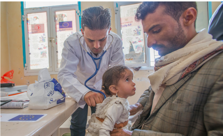
Children around the world, including this Yemeni girl, are among the hundreds of millions on the verge of starvation.

Excerpts from Lyndon LaRouche’s major contributions to this are also included in the program, especially from his 2014 “Four Laws” paper, stressing the Alexander Hamilton and Glass-Steagall banking re-regulation approach; and also LaRouche’s work on fixed-exchange rates, and the principle of productivity that must be reinstated for currencies and trade in a new economic architecture.