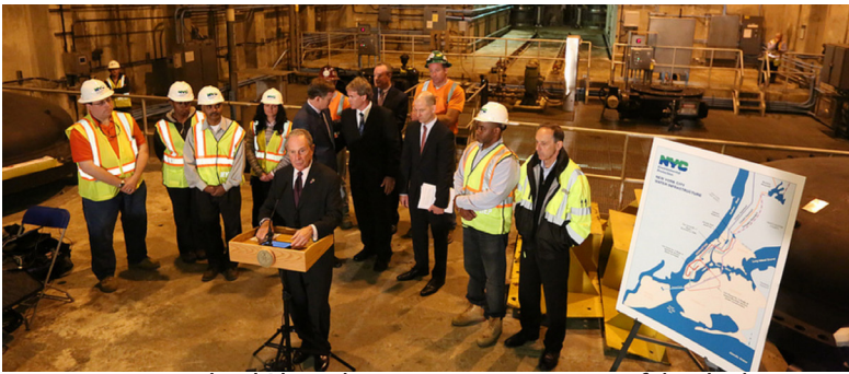
Former Mayor Michael Bloomberg activates a section of the the huge Water Tunnel 3 on Oct. 16, 2013.

We, the signers of this call, are of the conviction that the system of “globalization” with its brutal culture capitalism, has failed—economically, financially, and morally. We must make people the priority of the economy, which is not a self-service shop for billionaires and millionaires, but must serve the Common Good. The new economic order must guarantee the inalienable rights of all people on Earth.