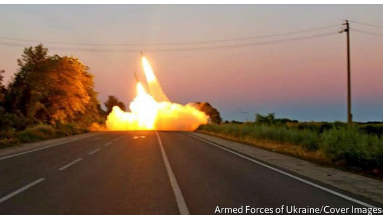
The senseless slaughter of the war that Ukraine can never win continues, as the U.S. ships weapons to kill Russians.