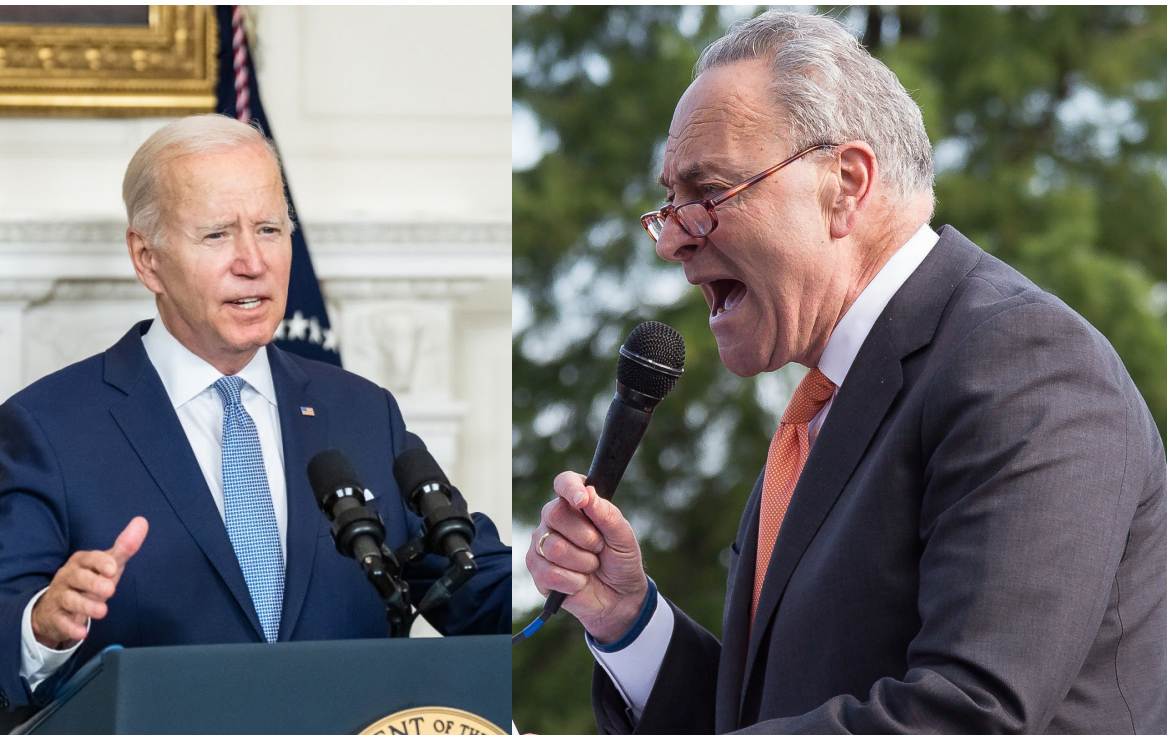
Sen. Chuck Schumer’s (D-NY) (R) insisted on introducing new pot decriminalization legislation over the objection of his President, Joe Biden (L), who won’t sign it.