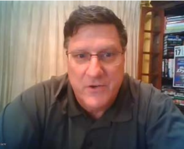
Nuclear war critic and former UN weapons inspector Scott Ritter

Continued from page 1 response by Scott Ritter, former Chief Weapons Inspector for the United Nations, to President Joe Biden’s recent comments on “the possibility of Russia using tactical nuclear weapons.” In an earlier interview with Redacted , Ritter said, “If NATO doesn’t back the hell