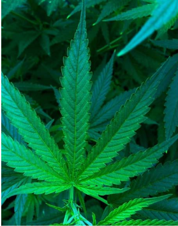
Pot pusher Sen. Chuck Schumer (D-NY) now wants passage of a dope banking bill and decriminalization.

Sources cited by Marijuana Moment and The Hill report that the strategy would involve tying decriminalization to an existing piece of banking reform legislation called the Safe Banking Act, which has support in the House, and about which Schumer recently assured its sponsor Rep. Ed Perlmutter (D-Colo), that he would find a way to get it done. Biden: Pardon Pot Users While Booker praised President Joe Biden for his recent announcement of plans to pardon all people convicted of federal marijuana possession and for his plans to organize a “a scientific study” that might lead to the Federal declassification of weed as a dangerous substance, both Booker and Schumer realize that the President is still against the core of their proposal, which would create a massive federally regulated pot industry. Privately, the senators have told colleagues that the study, which may take years, might wind