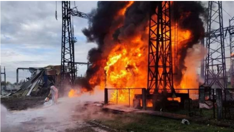
The war in Ukraine has grown hotter, as the Russians hit infrastructure targets and warn of a potential Ukrainian “dirty bomb.”