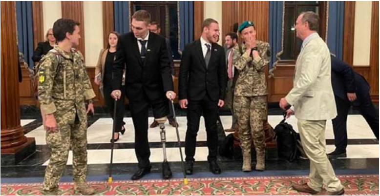
Members and leaders of the Nazi Azov Battalion meet with a fawning Rep. Adam Schiff (D-Calif) in Congress.