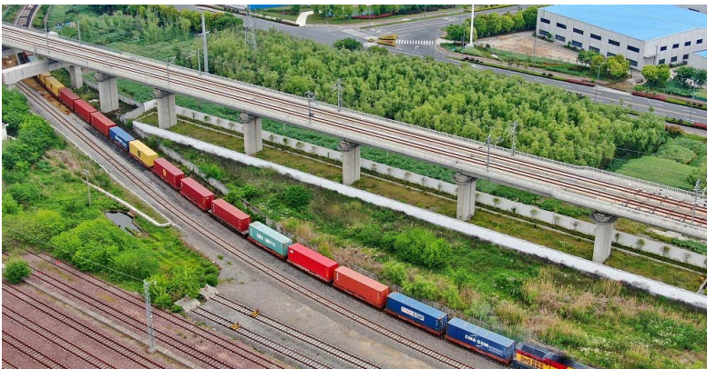
The containers of the sea-rail intermodal train at Jiangsu Hai'an Railway Logistics Base leave the freight station, April 30, 2022.

First of all, if you compare the rise of China, or the development of China, with the development of Europe or the West, the big difference, of course, is the scale. So far, after almost 250 years of industrial revolution, started by the UK, we only have less than 15% of the