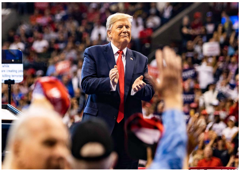
Credit: Trump in 2024 Trump: They are not after me—they are after YOU. I’m just standing in their way!

Party USA, which it controlled and manipulated from within “to eliminate LaRouche,” and regular physical assaults began occurring against organizers distributing LaRouche-associated publications outside factory gates in cities from New York to Chicago, forcing LaRouche activists to take action against the FBI’s CPUSA thugs. Why They Hate LaRouche In 1976, LaRouche launched his first bid for the U.S. Presidency as a US Labor Party candidate with a poster featuring Jimmy Carter’s face inside a nuclear mushroom cloud, which image also appeared on the first of multiple nationwide TV broadcasts. By 1980, Democratic Presidential Primary candidate Lyndon LaRouche was endorsed by officials in the Teamsters and other unions, as well as other major organizations and local and state government representatives. He was advocating for eliminating the threat of thermonuclear