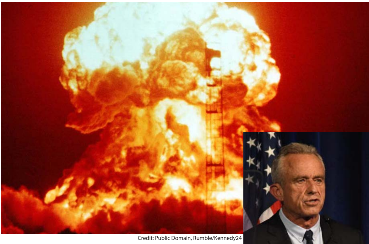
A nuclear test at the Nevada Test Site, April 18, 1953. Inset: Robert F. Kennedy, Jr. calls for Americans to join a movement for peace.