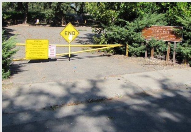
SARA Park is one of the Parkway access points closed by the county due to budget cuts.

In 1972, SARA promoted a $12.6 million bond issue which voters approved. Approximately 80 percent of the money was spent on Parkway land acquisition and development of the bicycle trail along the length of the Parkway. In 1978, SARA won voter approval of a