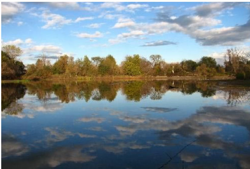
Sky and river

One of SARA's first projects was the production of a film, "Operation STAR – Save the American River." SARA's speaker's bureau had members talking at service clubs,