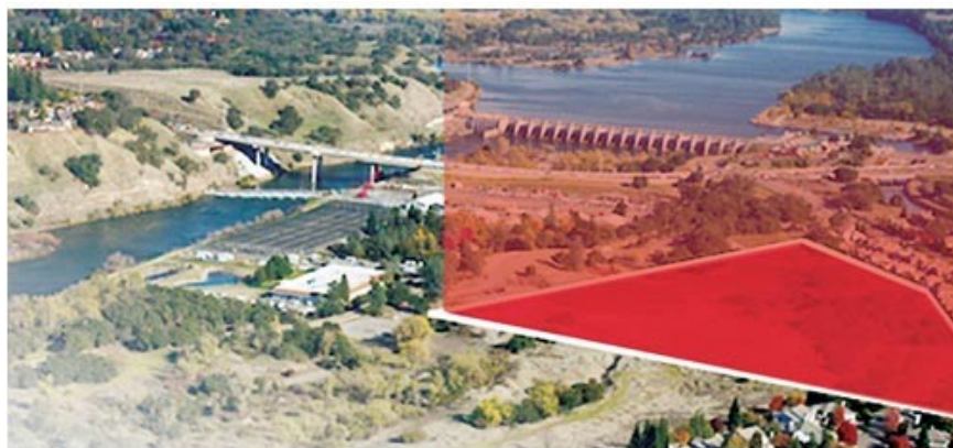
The proposed JOC location in Gold River, adjacent to the American River Parkway

The agencies have two "second choice" sites, both of which are far from the Parkway. The environmentally preferable site,