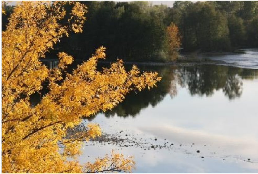
Fall along the shore

One of Cirill’s early concerns was inadequate water flows in the Lower American, which sometimes dribbled as low as 250 cubic feet per second. That led in 1969 to the organization of a coalition of fishing