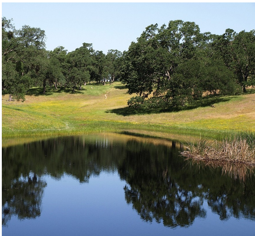
Deer Creek Hills Preserve

More information is available at: www.sacramentovalleyconservancy.org