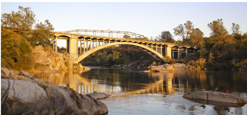
Rainbow Bridge over the American River in Folsom

SARA also has a Legacy program. For information on the program, please call the SARA office: (916) 482-2551.