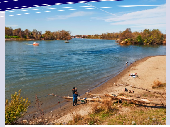
Confluence of the American and Sacramento Rivers near Discovery Park

Save the American River Association (SARA) representatives have been telling the Sacramento County Board of Supervisors that raucous, environmentally damaging events like 102.5 Live are prohibited by the American River Parkway Plan. The plan was approved unanimously by the county supervisors and entered into state law.