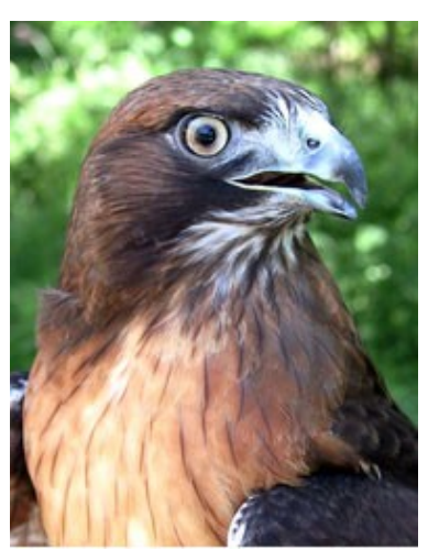
Tanner, a Red-tailed Hawk

The birds are tamed to the glove and act as animal ambassadors, visiting schools, taking part in programs and helping in the Nature Center's educational efforts.