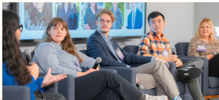
Five Alums Amplified members joined our team for the National Service Summit in Washington, DC, in September, sharing their experiences in a panel discussion and in meetings with members of Congress.

Throughout the year, we continued to expand our network of service year alums. Through The Alums Corner: The Scoop After Service , we delivered timely updates and actionable information, encouraged alums to connect through the AmeriCorps Alums LinkedIn group, and conducted outreach to bring more alums into the fold and renew their ties to the service year movement in 2026 and beyond.