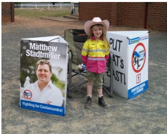
Tri-fold / 3 corflutes fixed together

If you are asked a question not answered by this FAQ, you can refer people to the policies page on our website at www.shootersfishersandfarmers.org.au