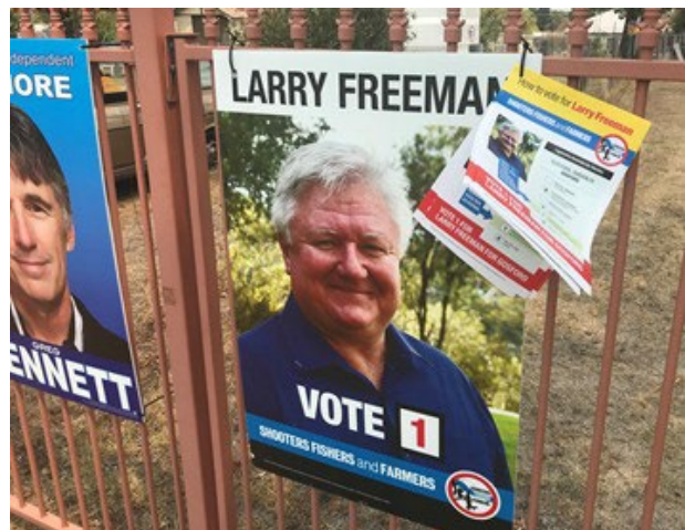
Self-serve HTVs tied to fence