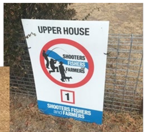
Cable tied to standard school fence