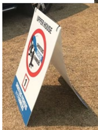
Bi-fold / 2 corflutes fixed at top