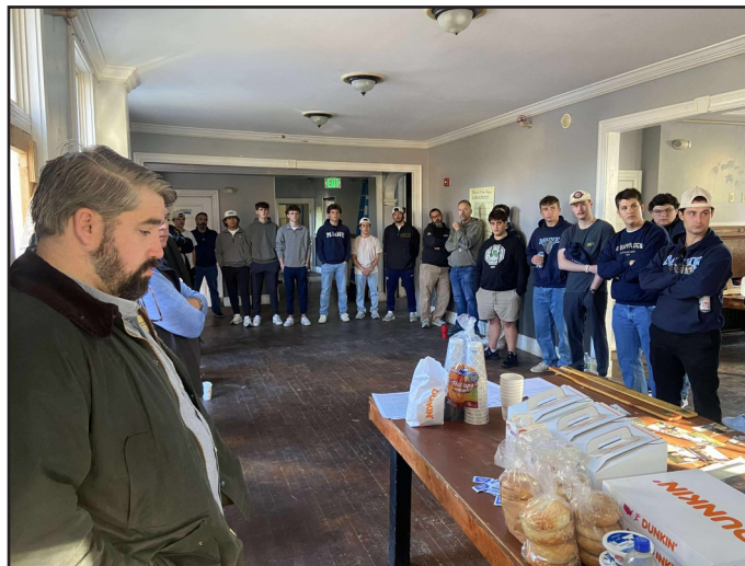
Alumni and undergraduates hear an update on the status of the chapter house from Corps members at Homecoming in October

Without being able to access these funds, it is highly unlikely the Corps can get a loan or keep the house in Phi Kap hands. Even if they could, a loan of $350,000 or more would