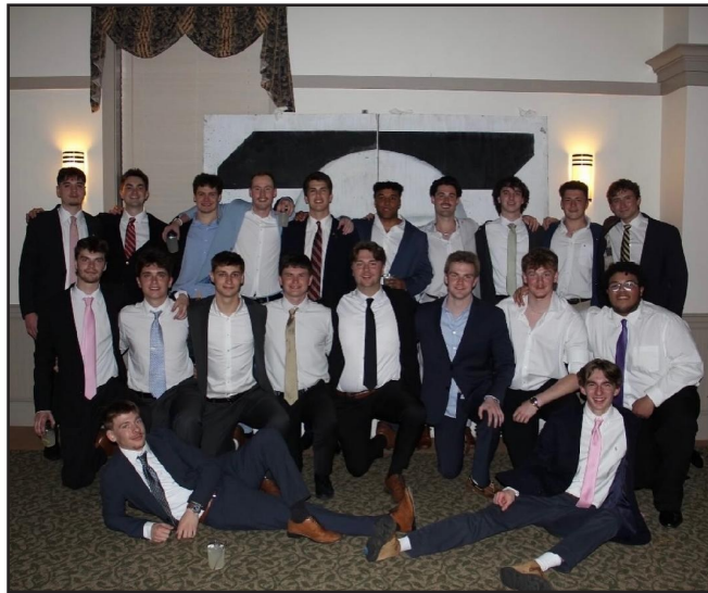
Members of the Alpha Delta Chapter