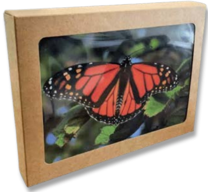
BOX OF 5 CARDS