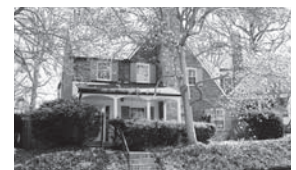
7801 Morningside Dr NW 3 bedrms | 2-1/2 baths | $764,000 Sold in Shepherd Park

Proud Sponsor of the Shepherd Elementary Fall Fest