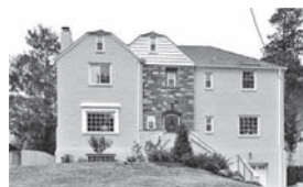
1709 Kalmia Rd NW 5 bedrms | 3-1/2 baths | $1,107,500 Listed in Colonial Village